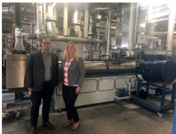
Figure 4. FKUR Hot Melt Extrusion equipment

In KaRMA2020, CID is researching at lab scale the most promising formulations which integrates the pretreated feathers into polymeric matrixes in order to obtain pellets, later on used for food packaging. The pilot scale facilities used by FKUR are allowing to optimise the processing conditions and upstream/downstream processes set up (such as feeding, cooling, cutting, etc.). In example, the feathers feeding operation is becoming one of our colleagues' headaches.