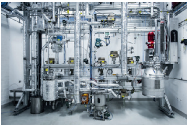
Figure 2. RISE Processum's pilot scale facility for Deep Eutectic Solvent.

The main challenges faced in the lab scale experiments are referred to find the adequate process conditions and solvent composition in order to obtain an acceptable degree of keratin solubilisation. Now that the critical bottlenecks and optimal process conditions are identified, RISE Processum is scaling up the process.