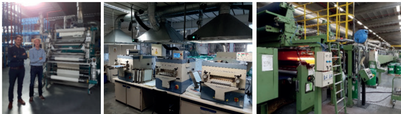
Figure 6. SIOEN facilities. Left side: the pilot coating machine, center: labdryers, right: industrial line

SIOEN is using its coating facilities to further evaluate the most promising formulations. Later in the project, industrial trials will be undertaken to make prototypes.