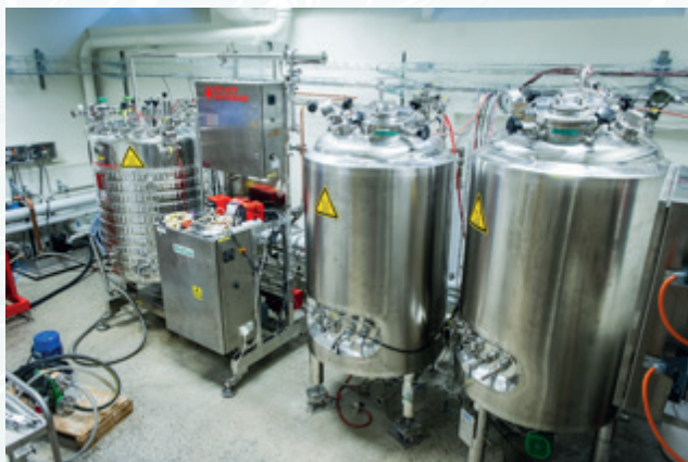
Figure 3. RISE Processum's 600L pilot line for biotechnological treatment.

The pilot scale research at RISE Processum will tune the raw material properties to be suitable for technical final products, biocomposites, films and fertilizers. Enzymatically-treated feathers will be implemented in technical products to improve the compatibility of feathers in the matrix or bring functionality (e.g. flame-retardancy) to the products. For this purpose, a 50L and 600L bio-reactor for enzymatic hydrolysis and fermentation are available.