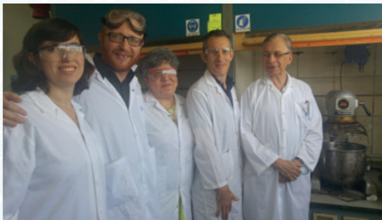
Figure 5. Daren Labs' team at the "kitchen"

The work carried out jointly by these two organisations is based on the chemical modification of keratin to increase their flame-retardant capacity. After performing lab-scale experiments, pilot scale reactor are being used to optimise the flame retardant production process.